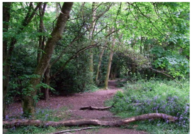
One of the many public footpaths through Tehidy Woods

In the centre of the park, but now private property, is a large building which was once Tehidy Hospital (sometimes referred to as Tehidy Sanatorium). It was originally converted from the Bassets' home into an isolation hospital for patients with tuberculosis, but in later years also dealt with patients who had strokes, head injuries and various lung disorders. It closed in 1986, and has now been converted into luxury apartments. Several new luxury houses have now been built around the former hospital buildings. There is no public right of way through this section of the park.