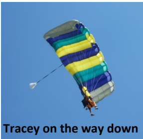
Tracey on the way down

This was especially poignant for Tracey, who's sister in law, aged only 39, sadly passed away after a battle with cancer last year in November of 2011.