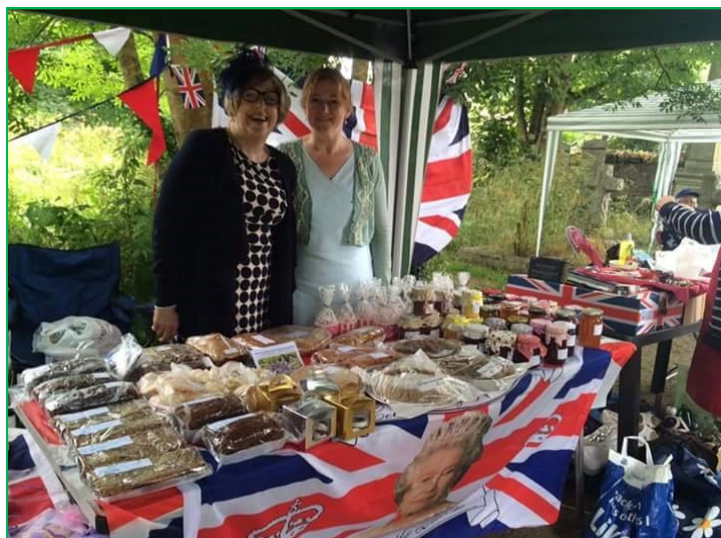
Photo of the Illogan WI stall